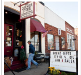
One-Stoplight Town Seeks Just One Mayor