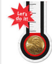
Op-Ed: Closing Loopholes Isn't Enough