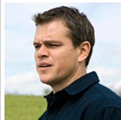
Movie Review: 'Promised Land,' With Matt Damon