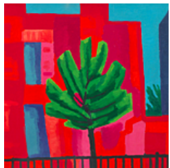
Native Talents, Shrugging at Europe